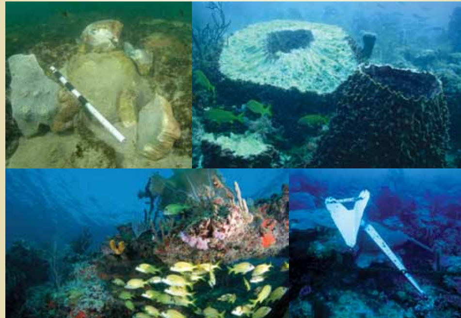
Vessel grounding and anchoring impacts (clockwise from top left): broken knobby brain coral ( Diploria clivosa ), severed giant barrel sponge ( Xestospongia muta ), an abandoned anchor on the reef, and a healthy southeast Florida coral reef.

AND HTTP://WWW.DEP.STATE.FL.US/COASTAL/PROGRAMS/CORAL/RIPR.HTM